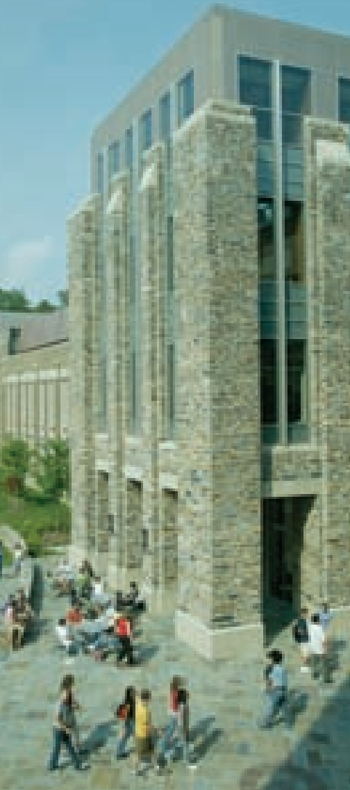
The Fitzpatrick Center at the Pratt School of Engineering